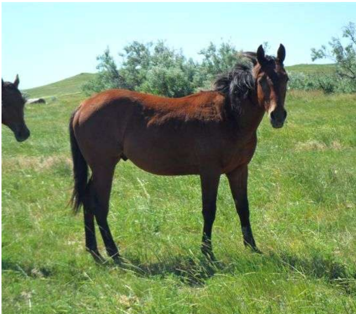
Donated by 17 Ranch

Don't forget to get your tickets at the Raffle Colt booth also located by the Sale Horse pens and Trade Show.